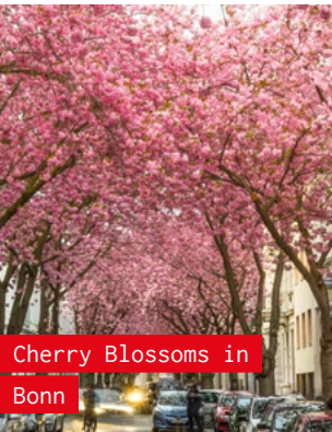
Cherry Blossoms in Bonn