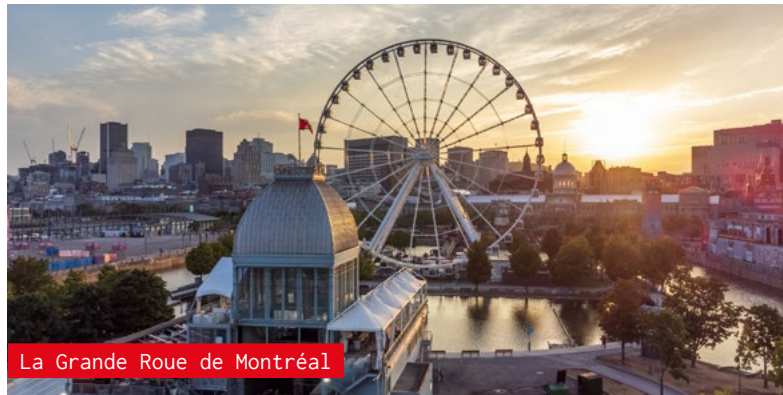
La Grande Roue de Montréal